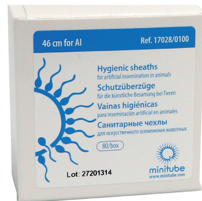
REF.: 17028/0100 Hygienic sheath 46 cm long, 80/roll

These 46 cm long hygienic covers were developed to prevent vaginal contamination and to reduce the risk of importing bacteria into the uterus, which can induce endometritis affecting fertility. The AI device is loaded with the semen straw and equipped with the Universal sheath. After that, it is introduced into the additional hygienic sheath (1).