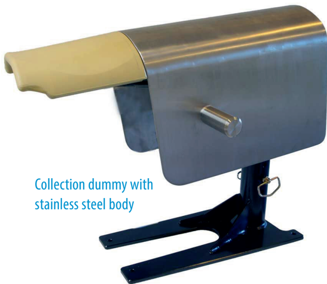
Collection dummy with stainless steel body