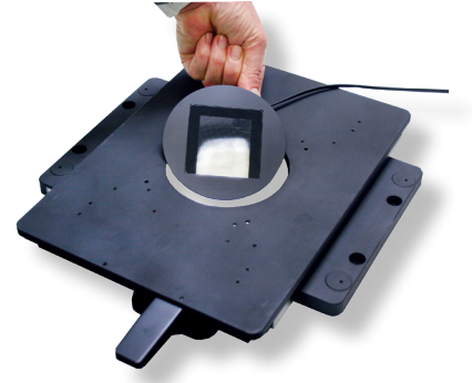
Heating system for an original stageof an inverted microscope, including installationREF.:12057/0705

Both, the heated stage and the additional insert plate, may be controlled by the same control unit with two output jacks (e.g. HTi 200).