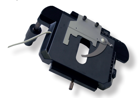
Heating system for the stage of an upright microscope including installation REF.: 12057/0700

Original microscope stages of all leading brands can be equipped with the Minitube heating system. This technique combines exact temperature control of the object on the stage with the user friendliness of the original microscope design. For the installation of the heating system, the original stage has to be sent to our premises.