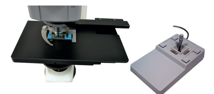
ScanStage , automatic stage for microscope, heating installed, with joystick (82 W)

The automated microscope stage has an integrated heating system and can be used with a variety of different microscopes. Analysis points within a counting chamber are automatically approached using the selected path of the microscope stage. Thus, the analysis time is reduced. The ScanStage can also be used with slide and cover glass.