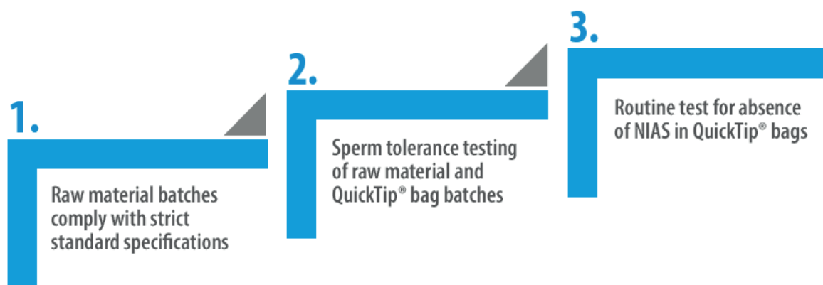
Figure 3: Three-level concept for quality assurance (NIAS: non-intentionally added substances)

All materials used in the manufacture of QuickTip® semen bags must be tested and proven to be biologically inactive and sperm friendly. Minitube as a specialized and ISO 9001:2015 certified producer of semen bags has a quality control program in place which consists of a three-level concept for the quality assurance and testing of raw materials and finished products that come into contact with semen.